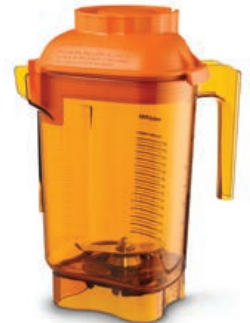
Advance® Orange Container 1.4 Litre