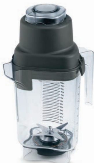
Optional 2.0 Litre XL Container