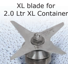
XL blade for 2.0 Ltr XL Container