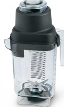
2.0 Litre XL Container