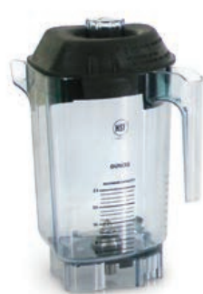
Advance® Container 0.9 Litre

One of the distinguishing features of the Vitamix range is that every container features double sealed bearings, where many of the competitive brands only feature one set of bearings. The advantage of double sealed bearings is that it runs cooler than single bearing containers and puts less load on the motor, enhancing machine life. Additionally, double bearings provide more rigidity and ensures the containers remain quiet over their lifetime, unlike other brands of containers with single bearings that become noisy over their lifetime.