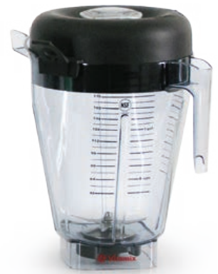
5.6 Litre XL Container