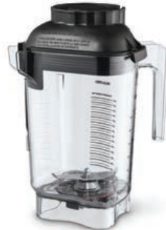
Advance® Container 1.4 Litre