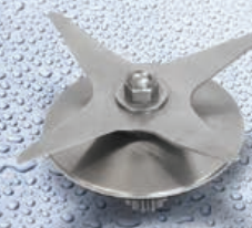
XL blade for 5.6 Ltr XL Container