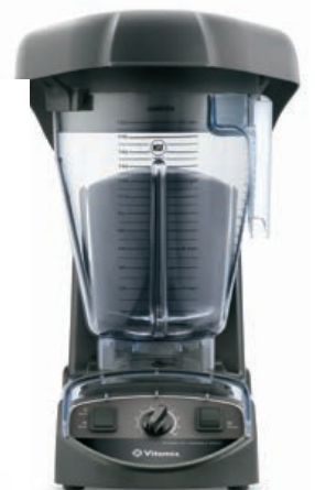
BEVERAGE BLENDER RANGE