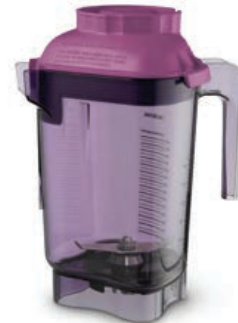
Advance® Purple Container 1.4 Litre