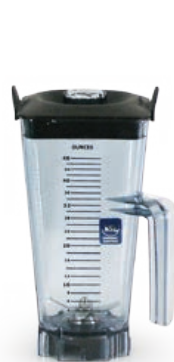
1.4 Litre Ice Container