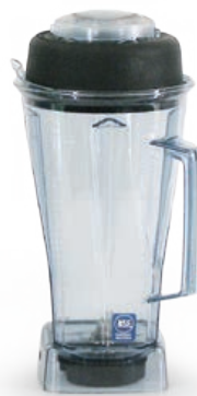
2.0 Litre Container